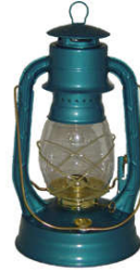
#8 Air Pilot Oil Lantern