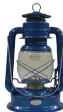
#90 D-Lite Oil Lantern