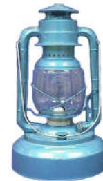
#2500 Jupiter Oil Lantern