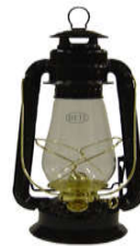
#20 Junior Oil Lantern