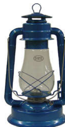
#80 Blizzard Oil Lantern